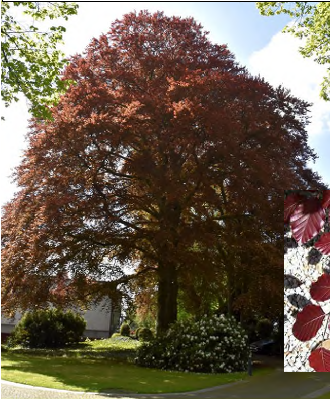
Blutbuche ( Fagus sylvatica purpurea )