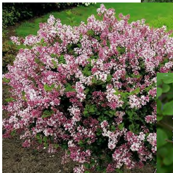
Zwergflieder ( Syringa meyeri „Palabin“)